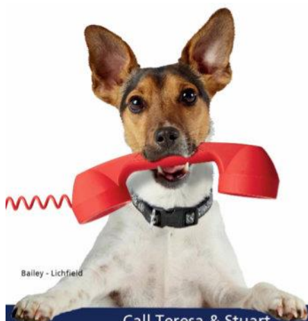
Bailey - Lichfield

Call 01480-880593 or 07904-585963 or email psychosibes@mushing.fsbusiness.co.uk