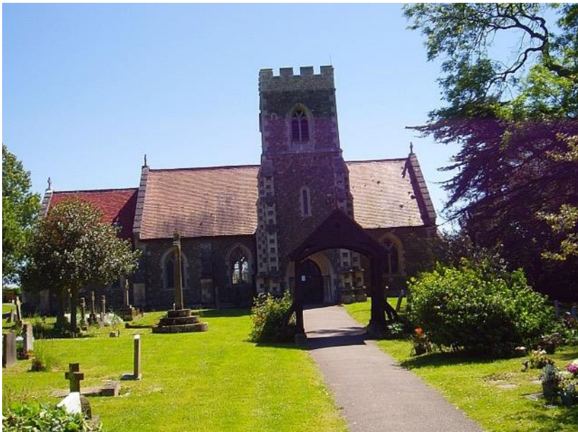
St Peter's Church, Papworth Everard