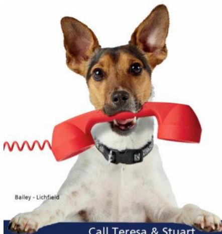
Bailey - Lichfield

Call 01480-880593 or 07904-585963 or email psychosibes@gmail.com